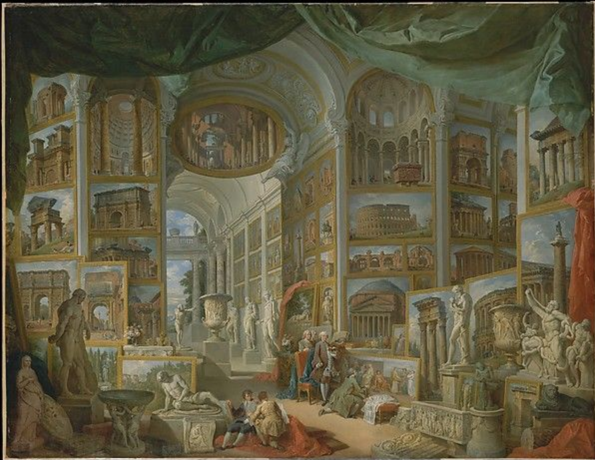
Giovanni Paolo Panini, Ancient Rome , 1757