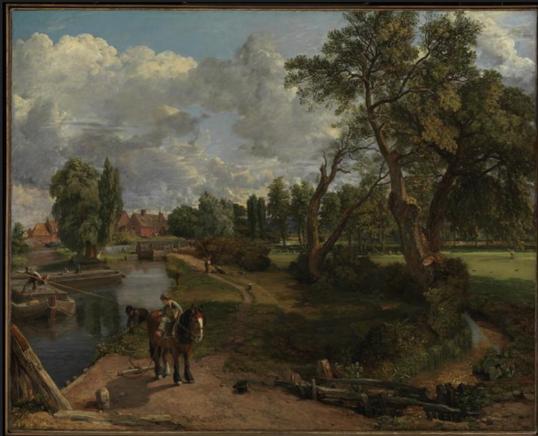
John Constable, Flatford Mill , 1816-17