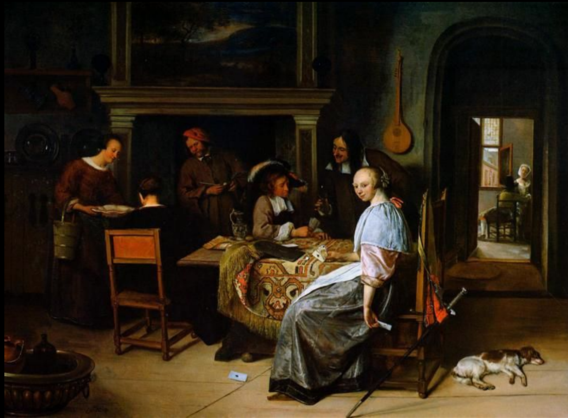
Jan Steen, Card Players , c. 1650