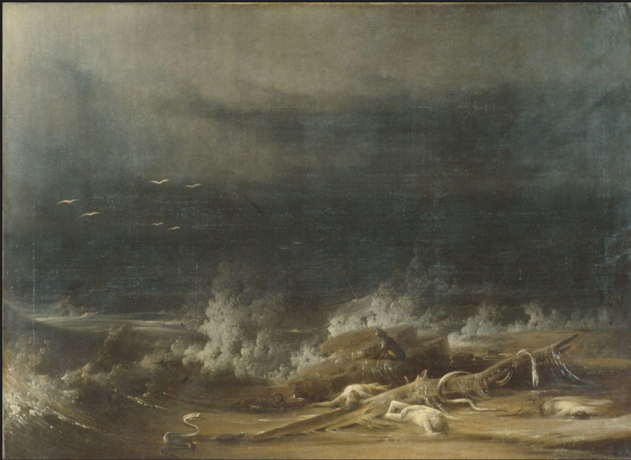
Joshua Shaw, The Deluge Towards its Close , 1813