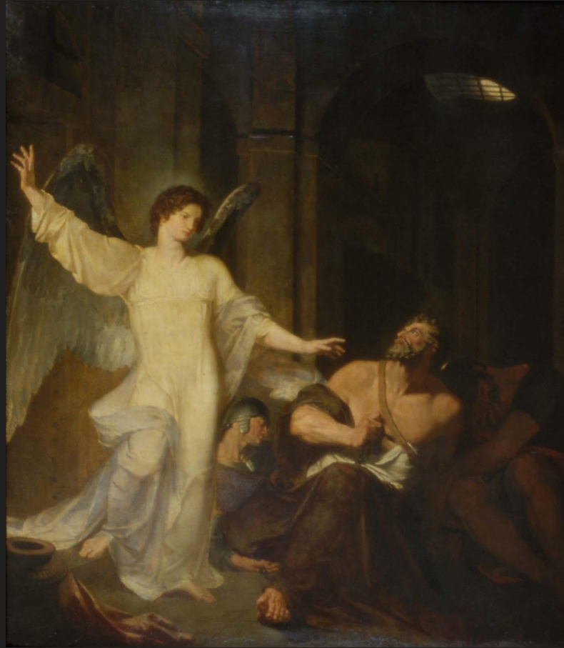
Washington Allston, The Angel Releasing St. Peter from Prison , 1814-16