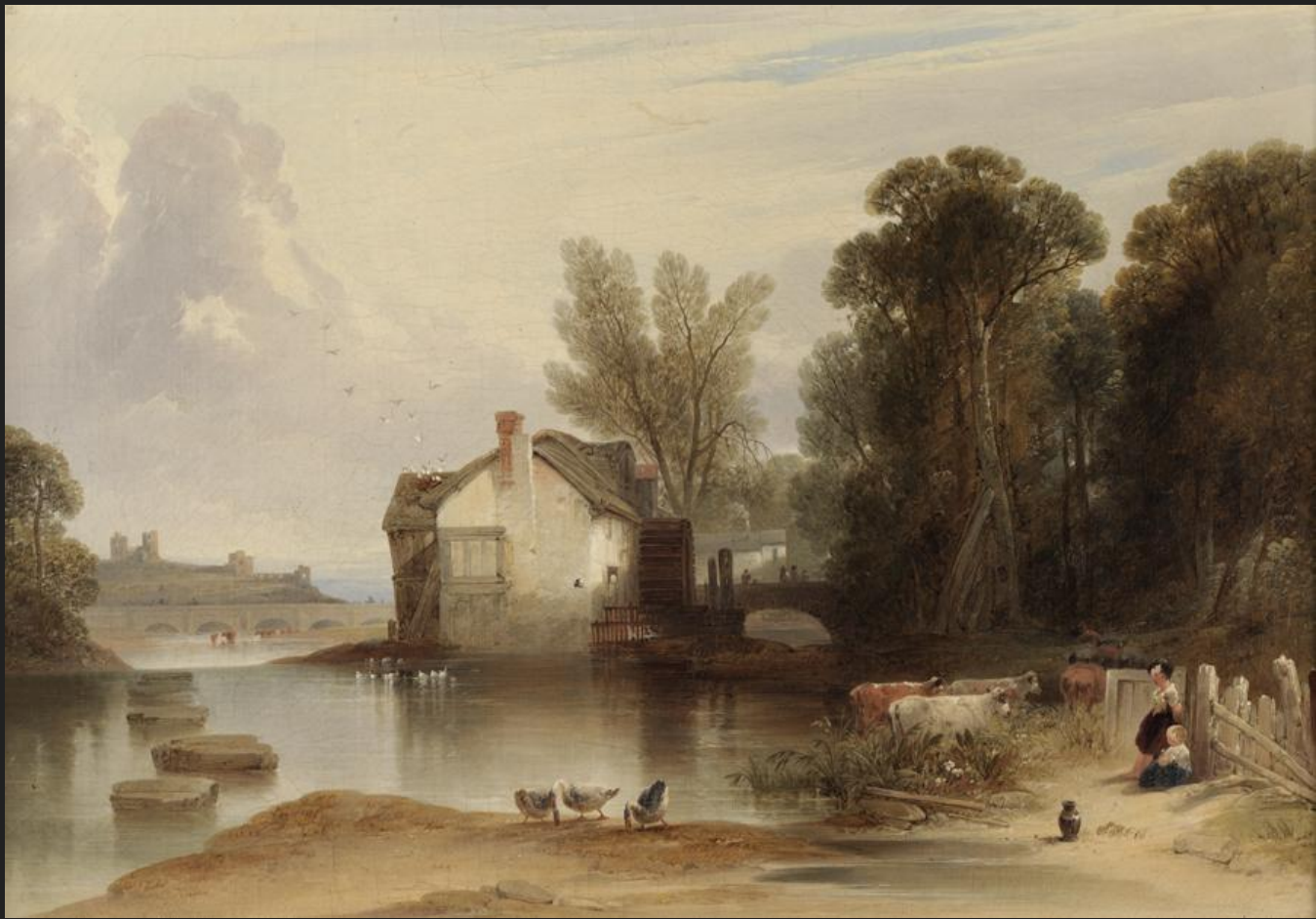
Joshua Shaw, Landscape with Water Mill , ca. 1818