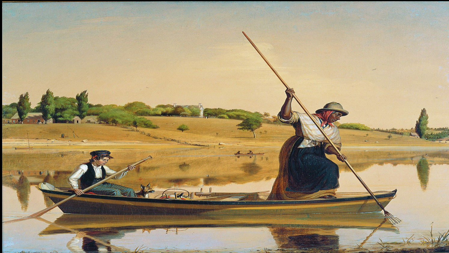
William Sidney Mount, Eel Spearing at Setauket , 1845