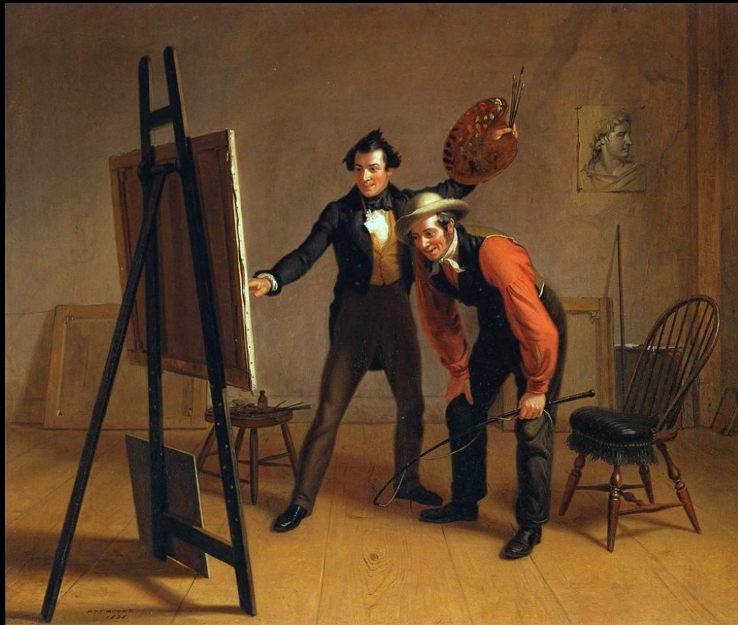
William Sidney Mount, The Painter's Triumph , 1838