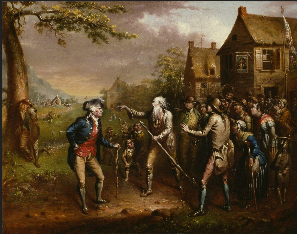
John Quidor, Rip Van Winkle , 1829 (Washington Irving)