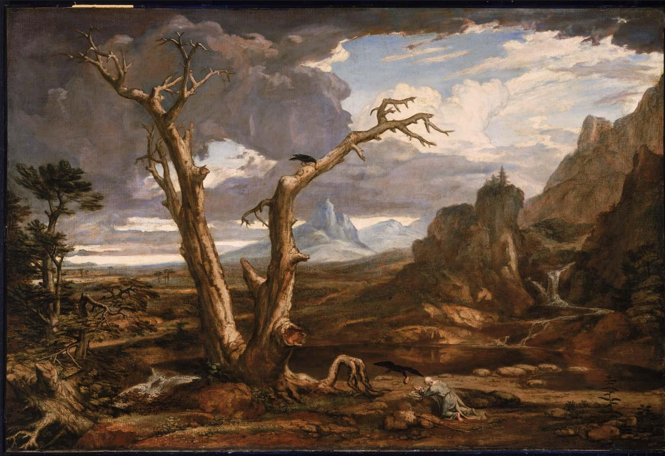
Washington Allston, Elijah in the Desert , 1818