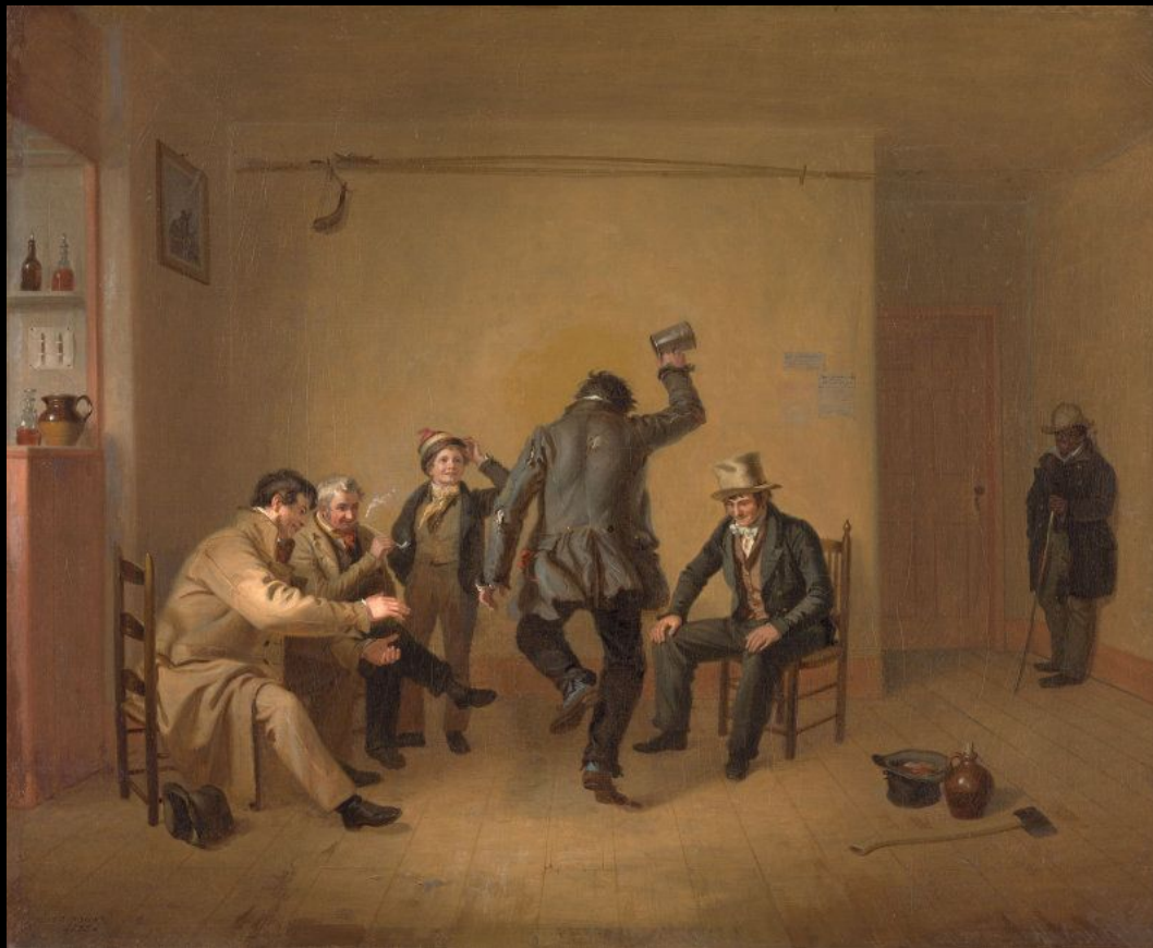
William Sidney Mount, Bar-room Scene , 1835