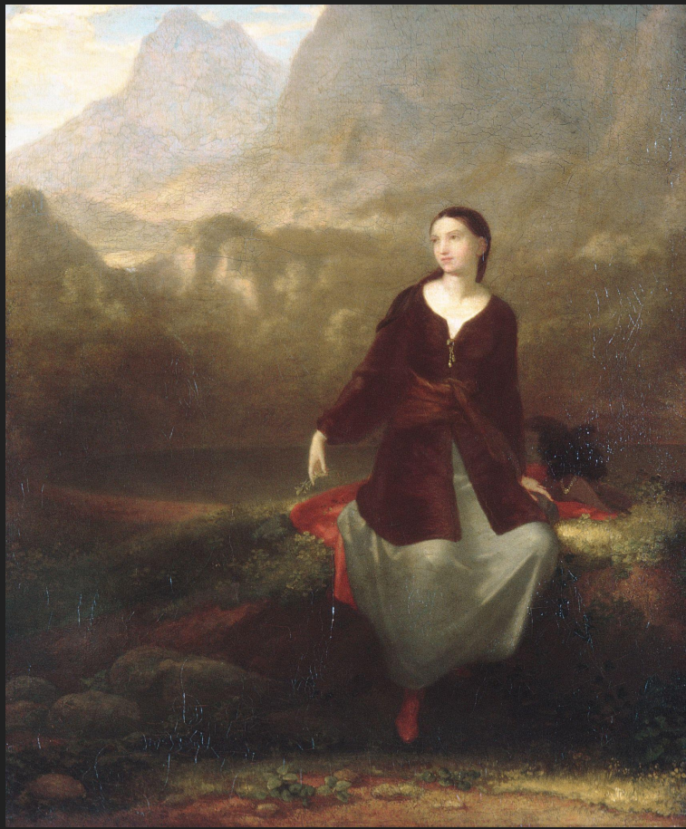
Washington Allston, The Spanish Girl in Reverie , 1831