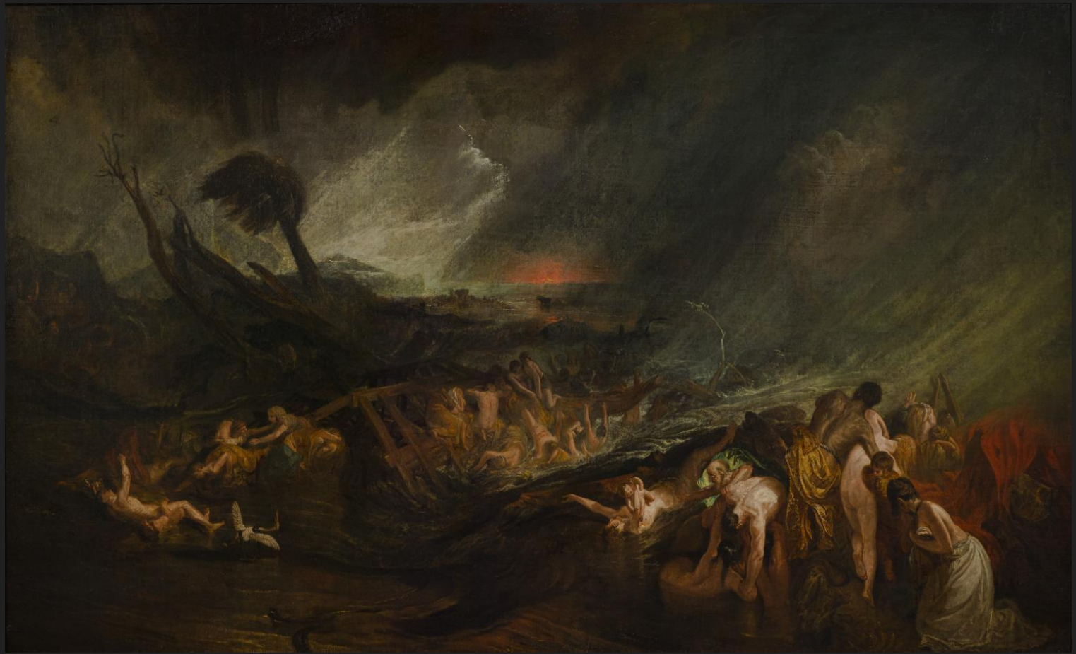
JMW Turner, The Deluge , exhibited in 1805