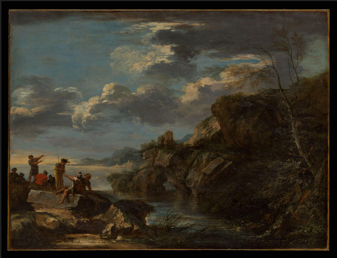
Salvator Rosa, Bandits on a Rocky Coast , 1655-60