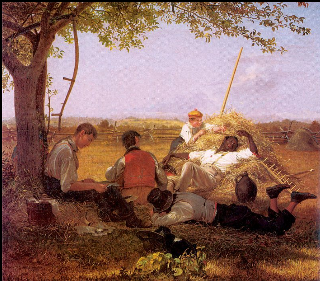
William Sidney Mount, Farmers Nooning , 1836