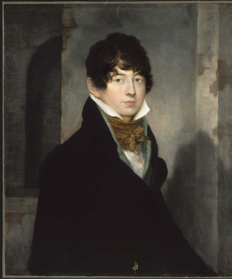
Washington Allston, Self-Portrait , 1805 (in Europe 1801-1818): Romanticism