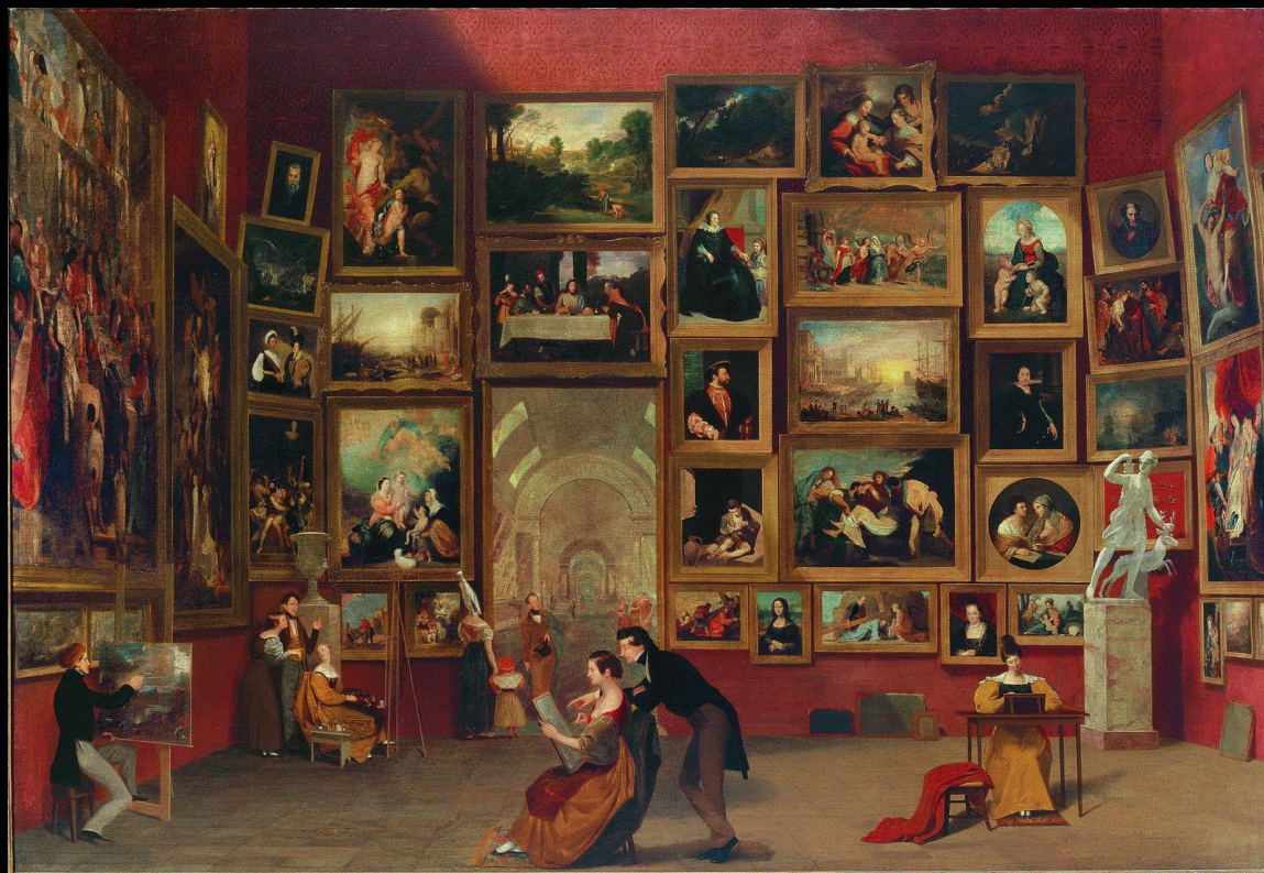
Samuel F. B. Morse, The Gallery of the Louvre , 1833