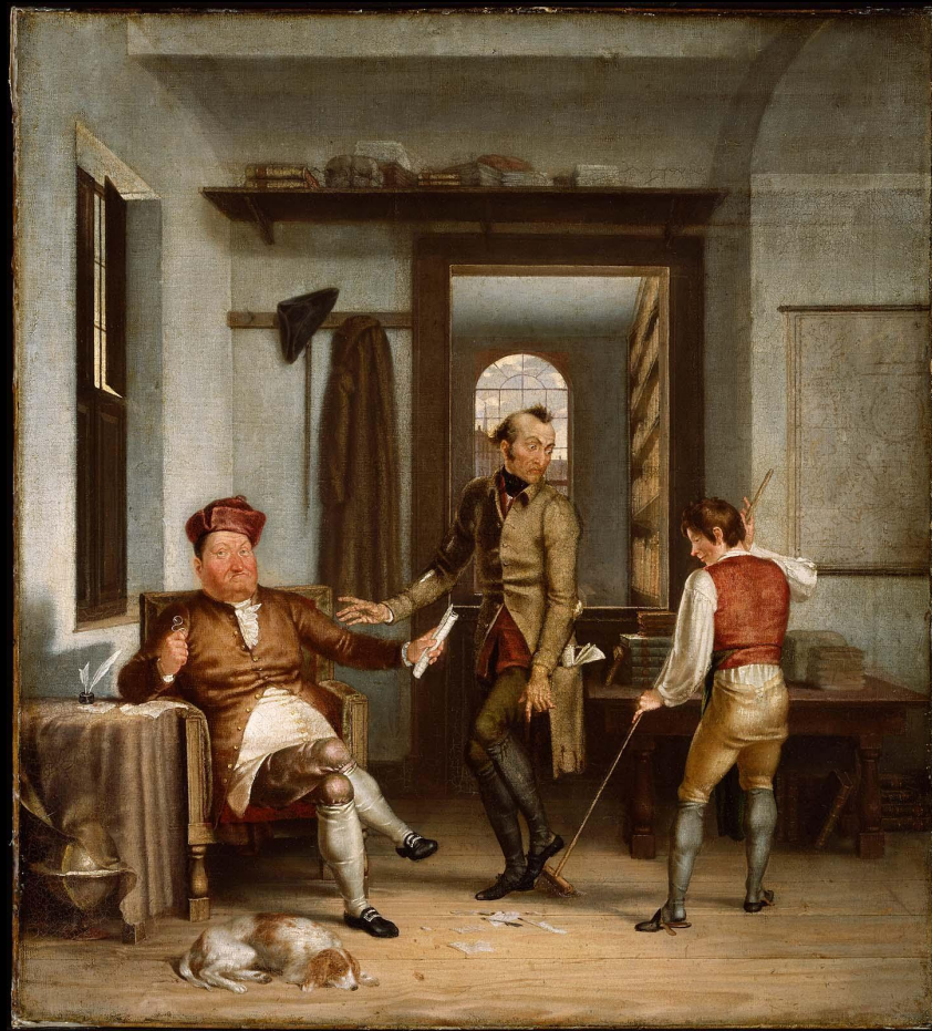
Washington Allston, The Poor Author and the Rich Bookseller , 1811