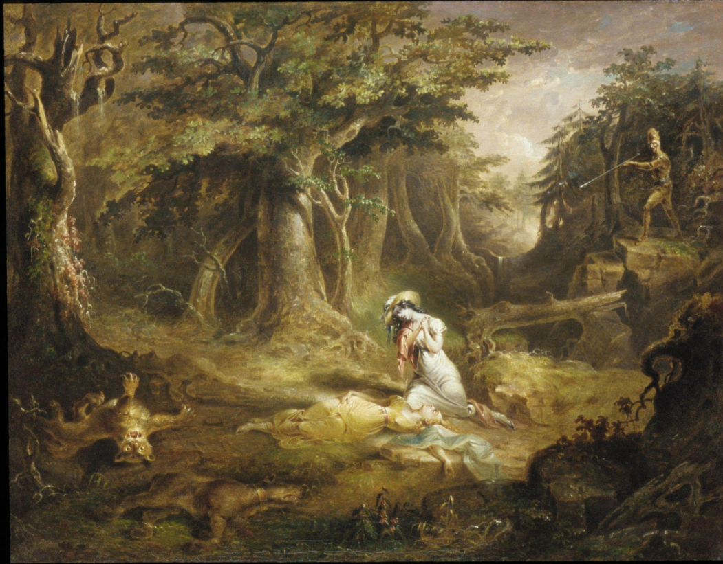
John Quidor, Leatherstocking's Revenge , 1832 (James Fenimore Cooper)