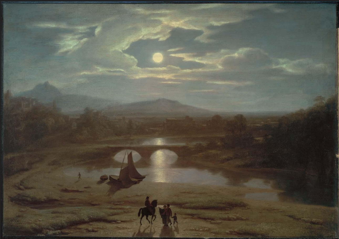
Washington Allston, Moonlit Landscape , 1819