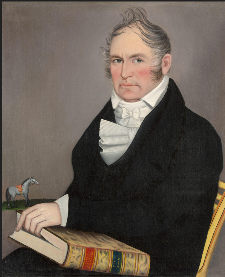
Ammi Phillips, Cornelius Allerton , 1821-22