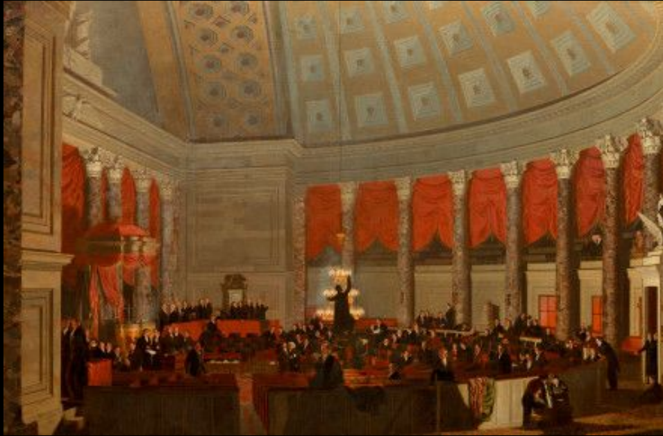
Samuel F.B. Morse, The House of Representatives , 1822, 86 x 130 inches