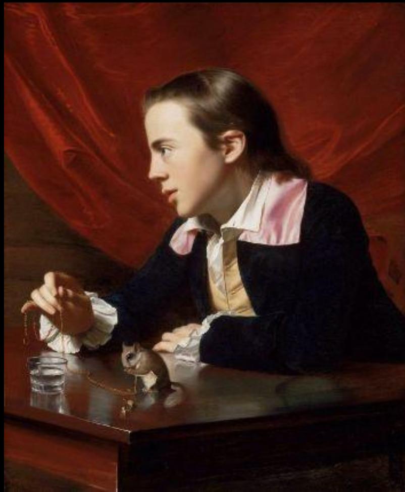
John Singleton Copley, Henry Pelham (Boy with a Squirrel) , 1765