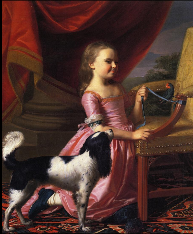
John Singleton Copley, Young Lady with Bird and Dog , 1767