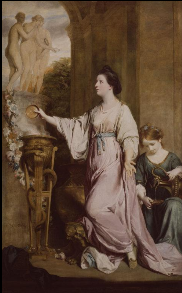
Sir Joshua Reynolds, Lady Sarah Bunbury Sacrificing to the Graces , 1763-65