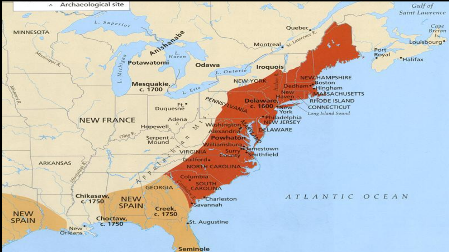
Map of colonial North America