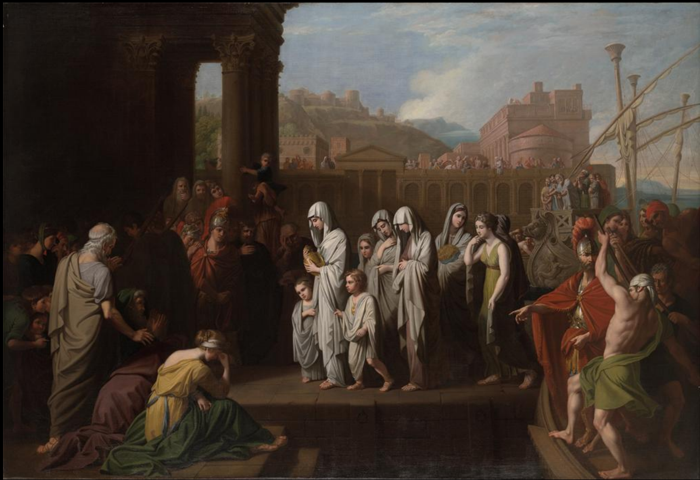
Benjamin West, Agrippina Landing at Brundisium with the Ashes of Germanicus , 1767