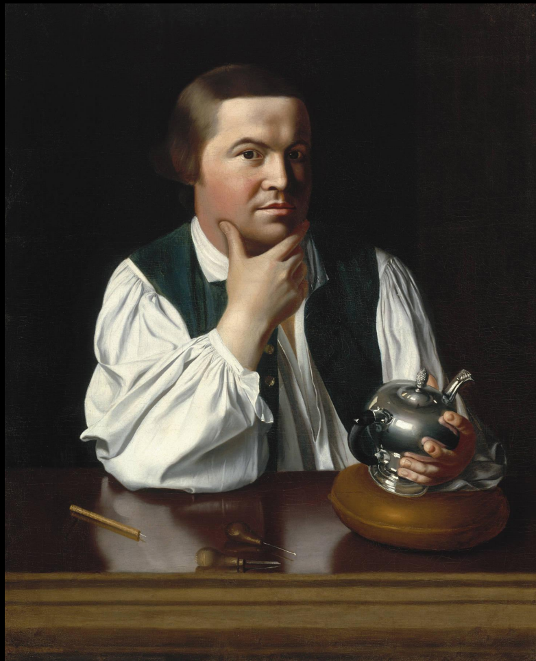
John Singleton Copley, Portrait of Paul Revere , 1768