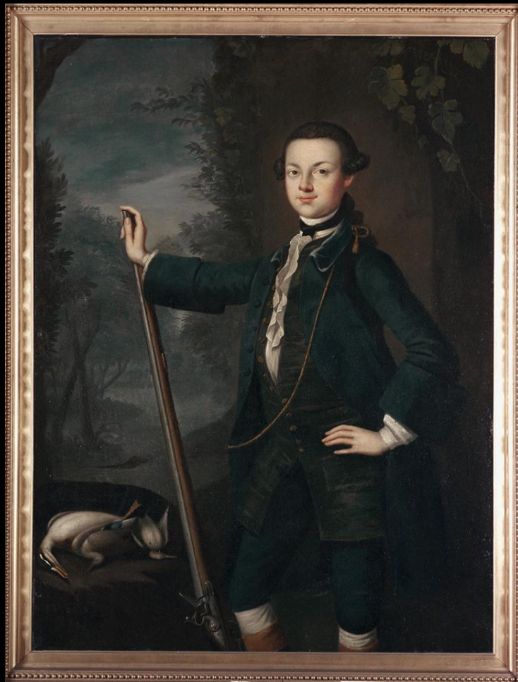
Benjamin West, Thomas Mifflin , 1758-9