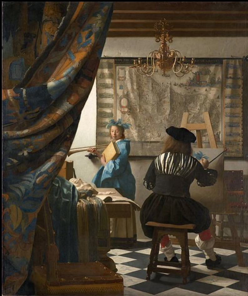
Johannes Vermeer, The Art of Painting , 1666-8