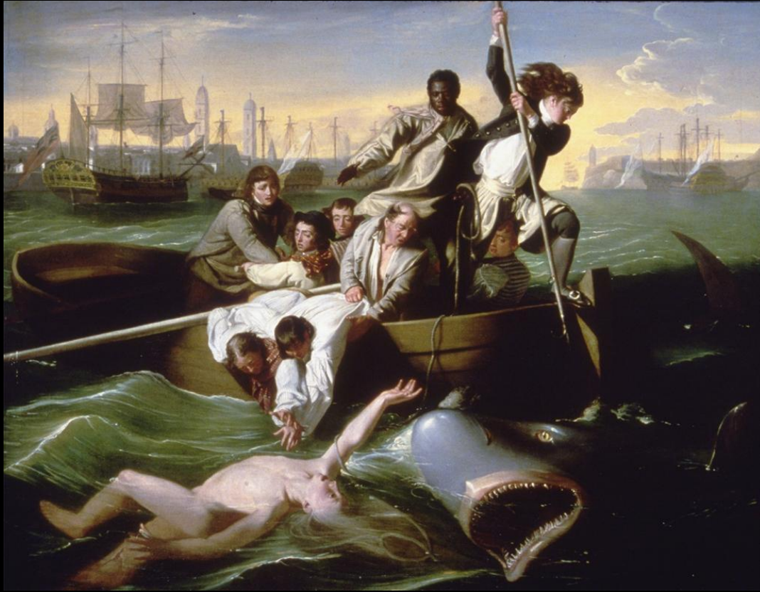
John Singleton Copley, Watson and the Shark , 1776