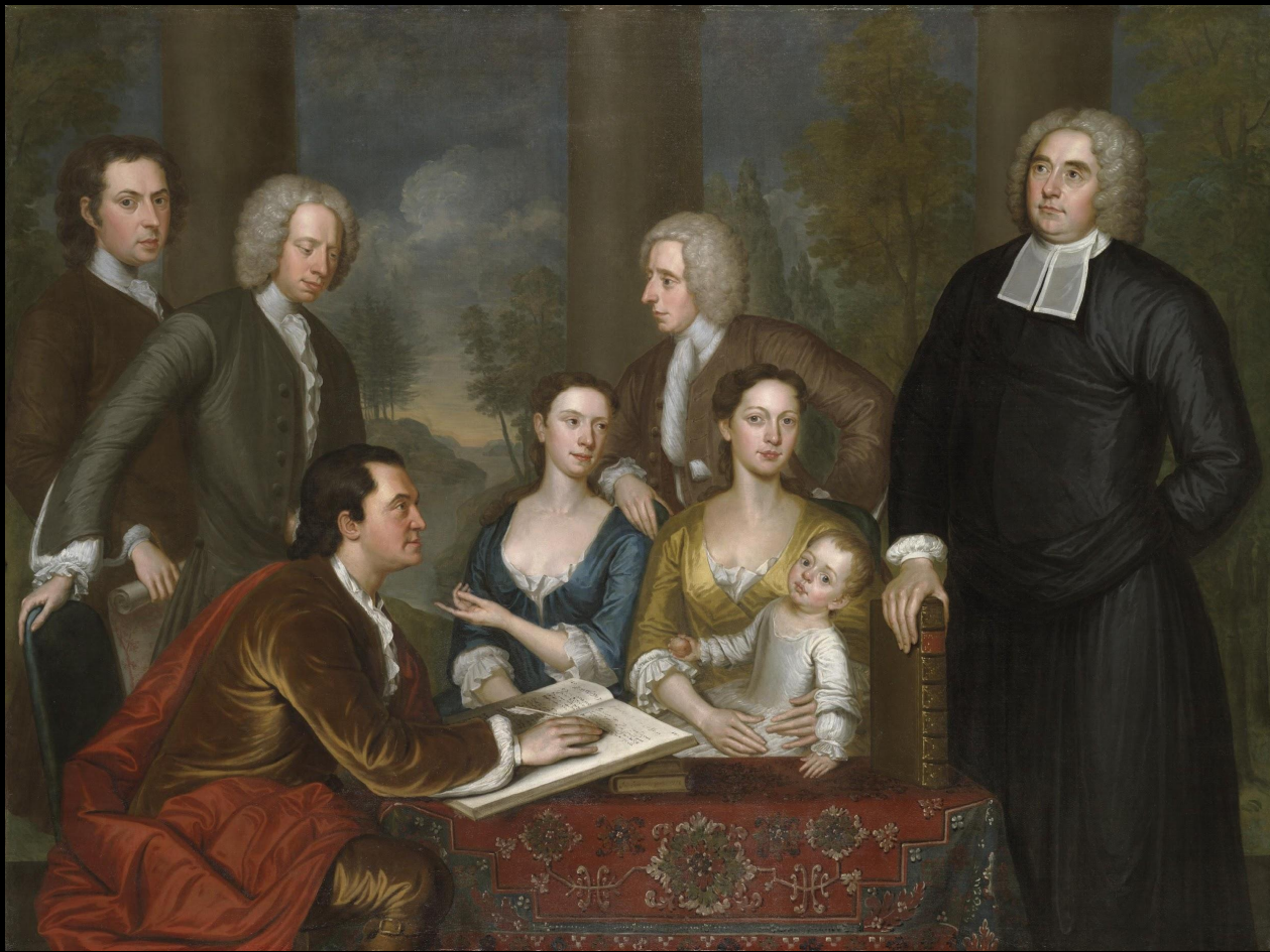
John Smibert, Dean Berkeley and His Entourage (The Bermuda Group) , 1729