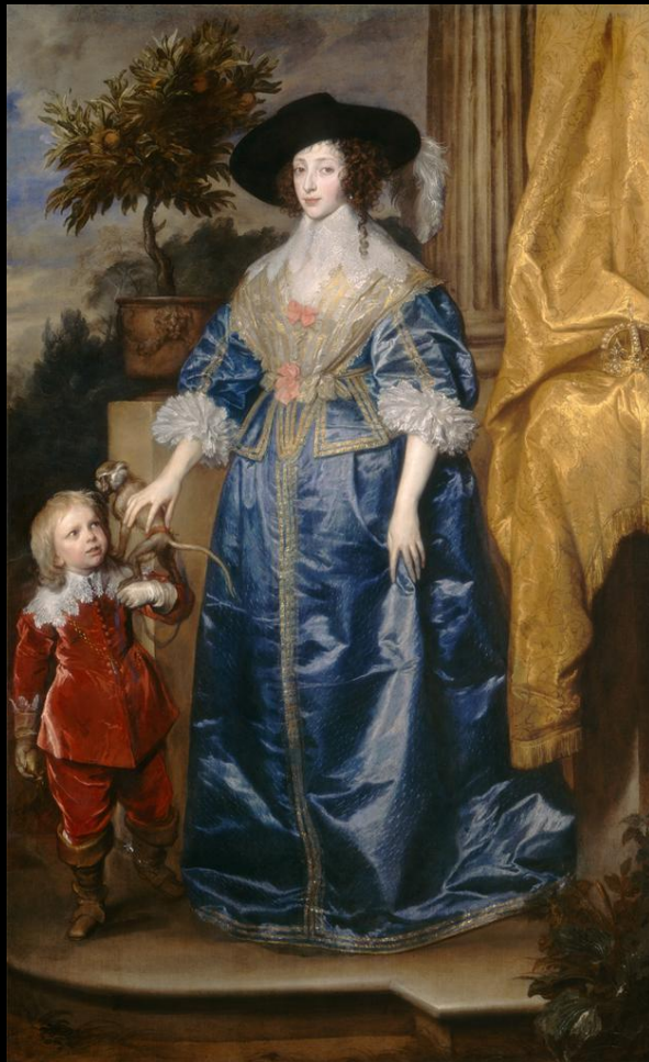
Anthony Van Dyck, Queen Henrietta Maria with Jeffrey Hudson, 1633