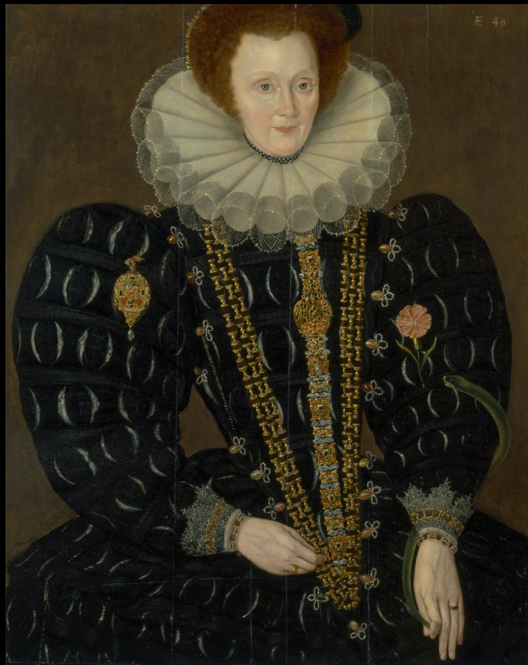
Marcus Gheeraerts the Younger, A Woman Called Lady Elizabeth Knightley, 1591