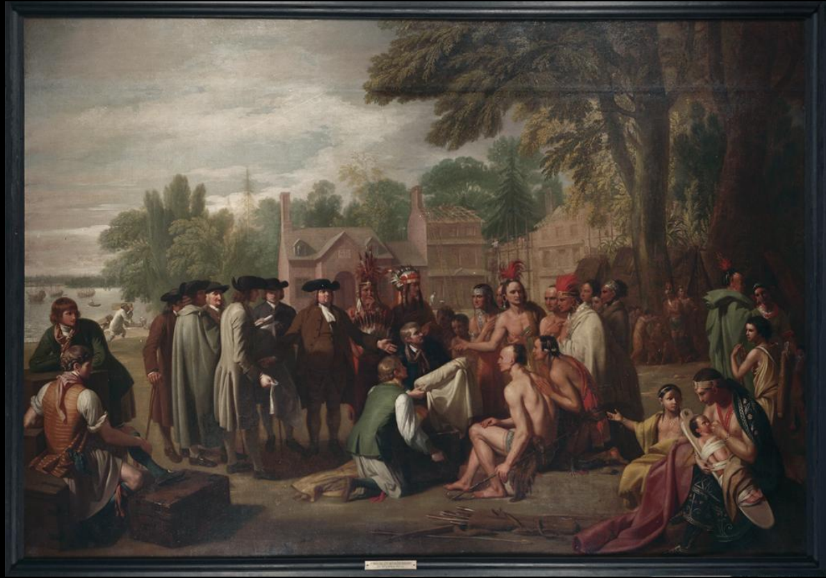
Benjamin West, William Penn's Treaty with the Indians in 1683 , 1771-2