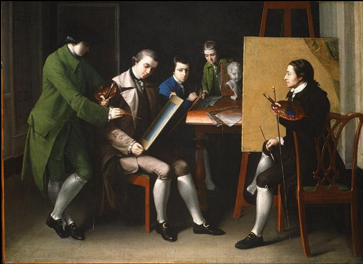
Matthew Pratt, The American School , 1765