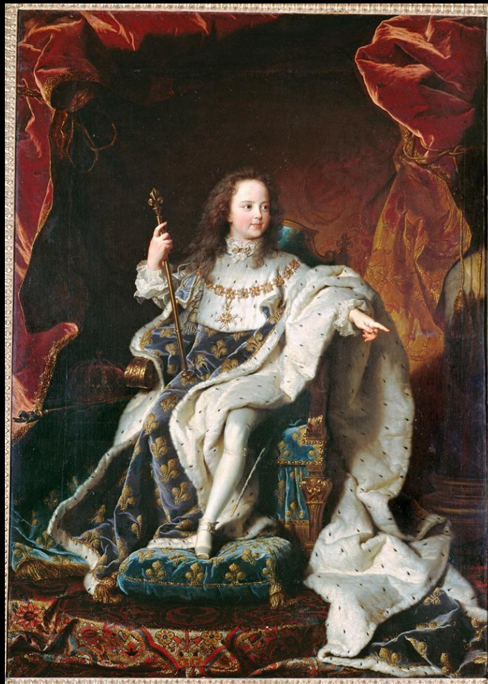
Hyacinthe Rigaud, Louis XV as a Child, 1715