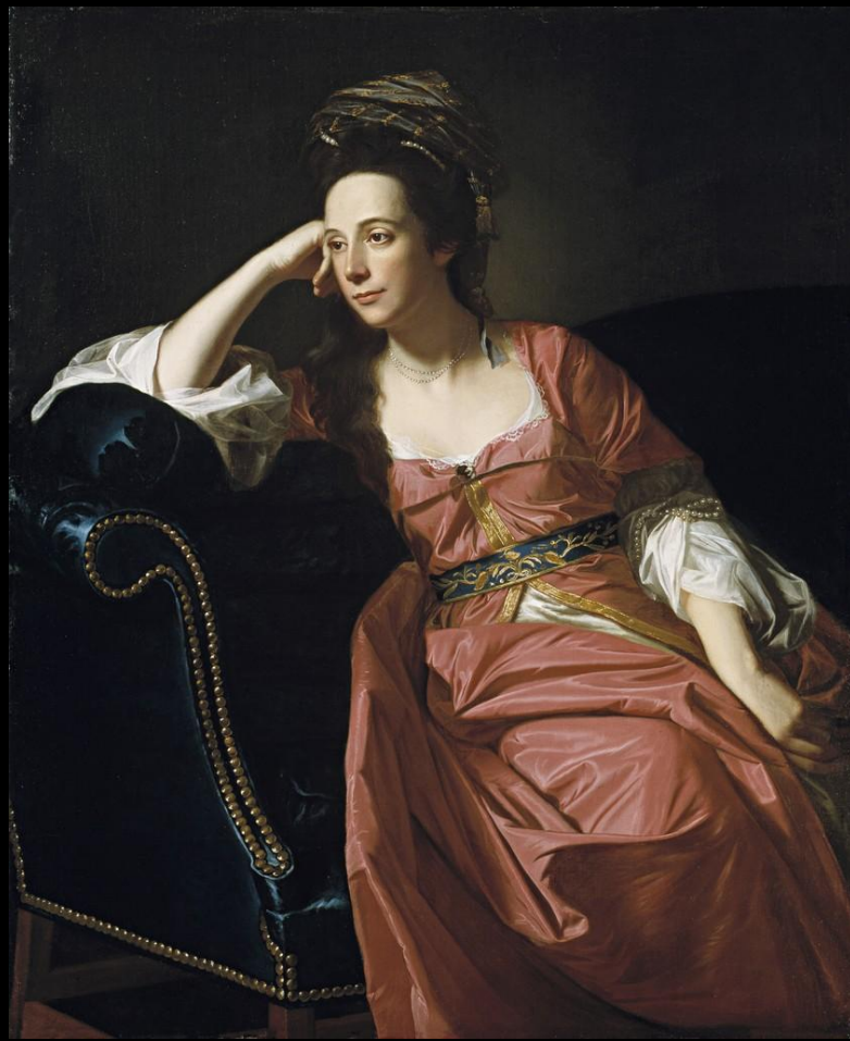
John Singleton Copley, Mrs. Thomas Gage (Margaret Kemble Gage) , 1771