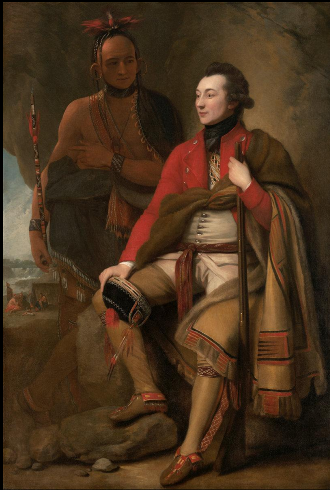
Benjamin West, Colonel Guy Johnson & Karonghyontye (Capt. David Hill) , 1776