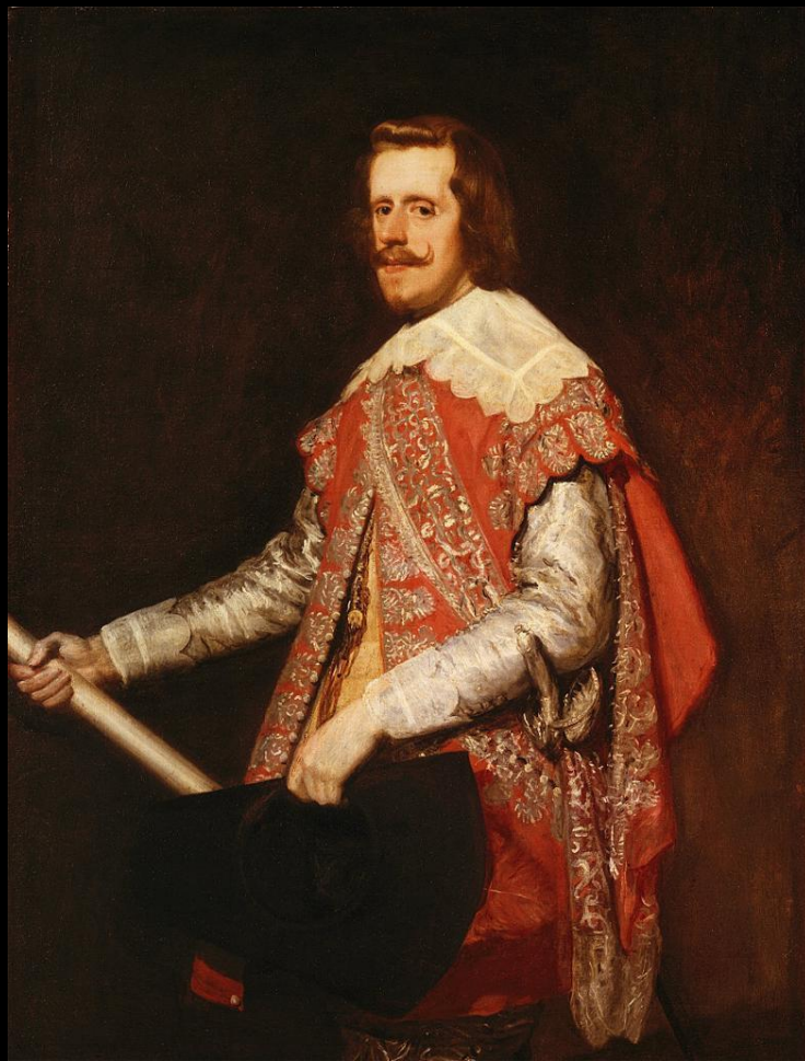
Diego Velazquez, Philip IV of Spain, 1644