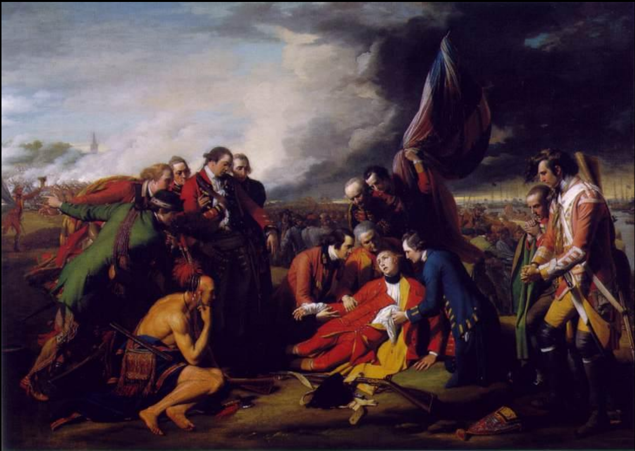
Benjamin West, The Death of General Wolfe , 1770